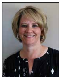
Mayor Debbie Winn